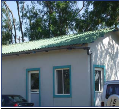
Site replaced asbestos roof with pre coated steel sheets.