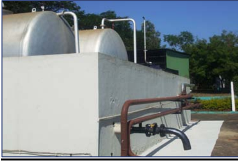
Site has modified the dike wall as per approved drawing specification and installed a ball valve to drain after necessary checks for traces of oil.