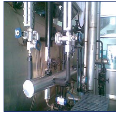
Site replaces asbestos insulation on Boilers fuel piping with super flex insulation material.